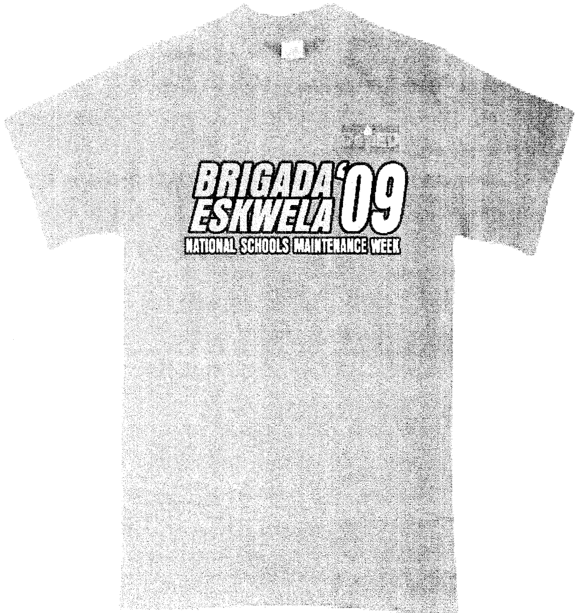
Brigada Eskwela '09 T-shirt Design Shirt color: Royal Blue Style: Round neck, short-sleeved

Enclosure No. 1 to DepED Memorandum No. 168, s. 2009