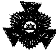
Alpha Phi Omega Service Sorority